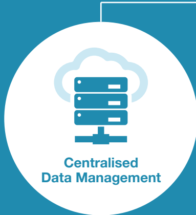
Centralised Data Management