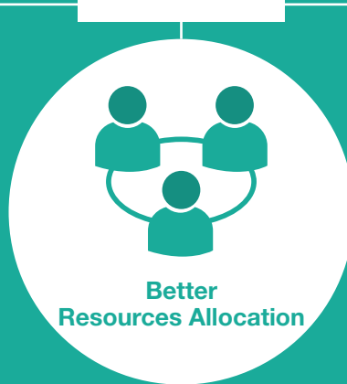
Better Resources Allocation